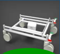
Central Locking Base