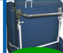
Lay-flat Support Bar

"The Sertain® is the safest method of transfer for patients with an endotracheal tube in situ, or those patients who require mechanical ventilation."